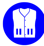
High Visibility Clothing