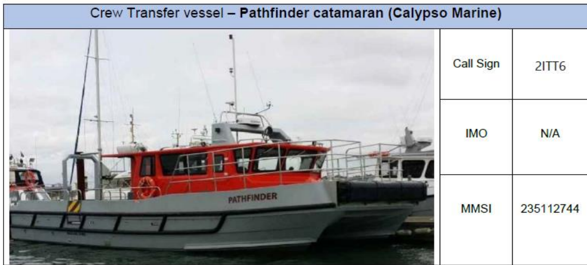
Table 1: Vessel details