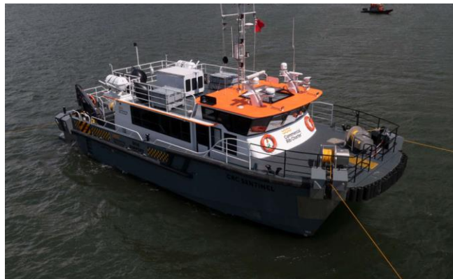
Figure 2- CRC Sentinel

Diving operations shall run 24hrs and be assisted by the workboat CRC Sentinel. Mariners are directed to keep a minimum 500m clearance from the CRC Sentinel during diving operations.